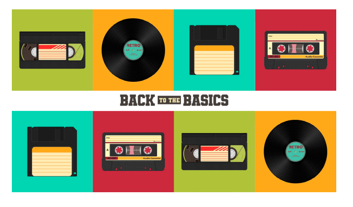
His Design | April 7, 2019